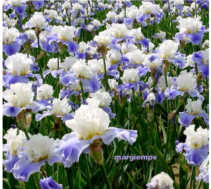
TALL COOL ONE

Next, working with your digital camera is another major area with which to familiarize yourself with. Here are a few tips I learned over the last several