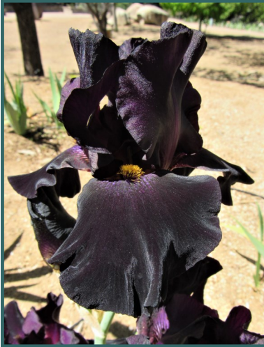
'Interpol' (Plough, 1972)

An Affiliate of the American Iris Society