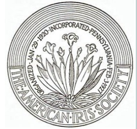
Original AIS seal

Winter came early While plants snuggled underground, Resisting its frosty grip - Sue Clark