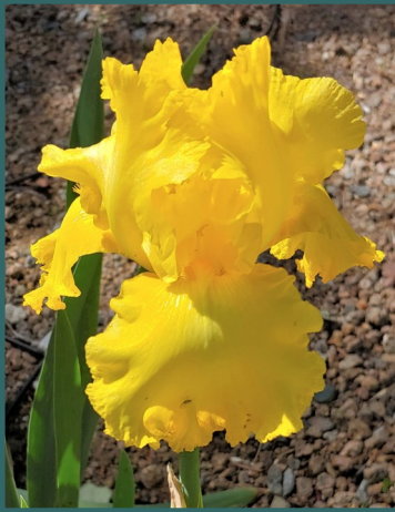
'Lemon Pledge' (Spears, 2003)

An Affiliate of the American Iris Society