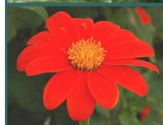
From top: Thunbergia , lisianthus , Bidens cernua , Scabiosa columaria 'Pink Mist' (often called pincushion flower), and Tithonia (Mexican Sunflower)