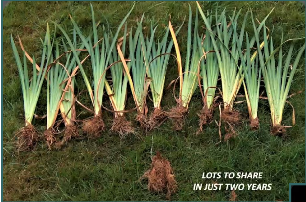
LOTS TO SHARE IN JUST TWO YEARS