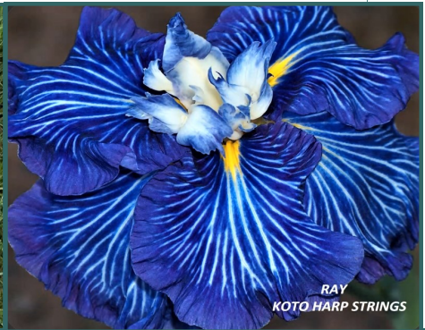
And in Two Years You May See This