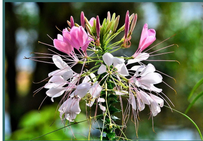
From Top: Asclepias incarnata (Swamp milkweed) and Cleome hassleriana (Spider flower)